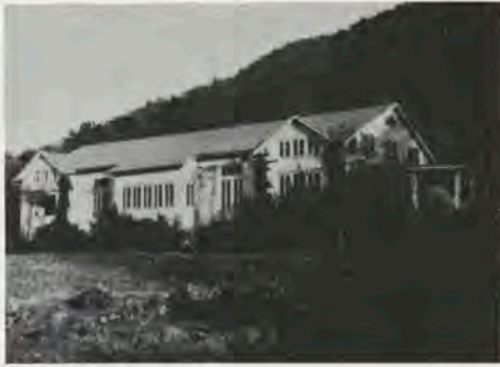
Hook's Old Laurel House.

she started the firm of Hook and Remington.