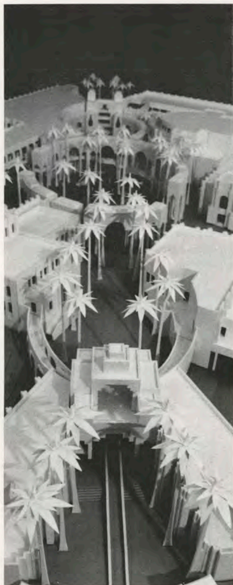
Rudoff's design of the Beverly Hills Civic Center