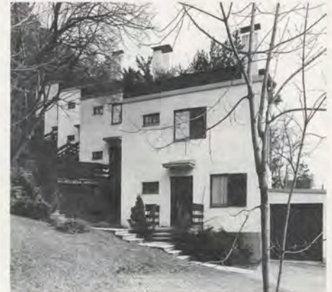
Row houses, Hinterbruehl, 1960s